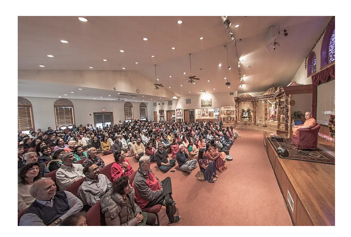
Arsha Bodha Center - Hall 3